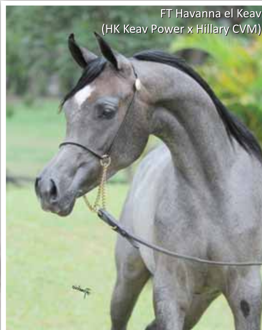
FT Havanna el Keav (HK Keav Power x Hillary CVM)