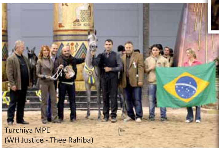
Turchiya MPE (WH Justice - Thee Rahiba)