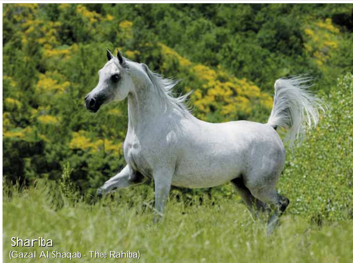
Shariba (Gazal Al Shaqab - Thee Rahiba)

TA: And what are your best offspring born in Haras Cruzeiro so far that you are most satisfied with and why?