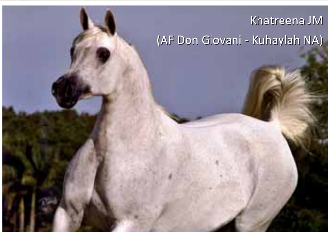
Khatreena JM (AF Don Giovani - Kuhaylah NA)