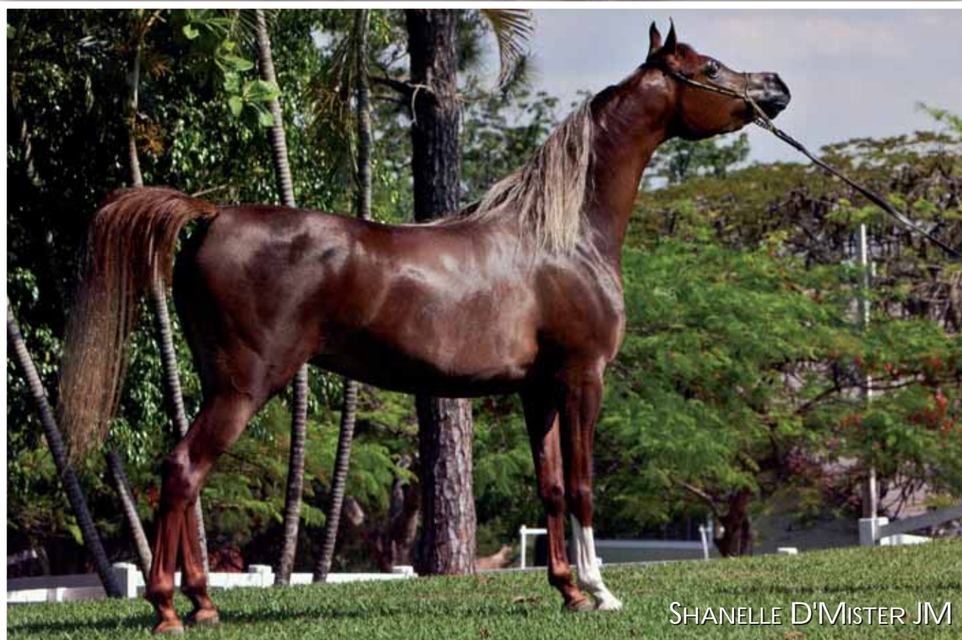
SHANELLE D'MISTER JM