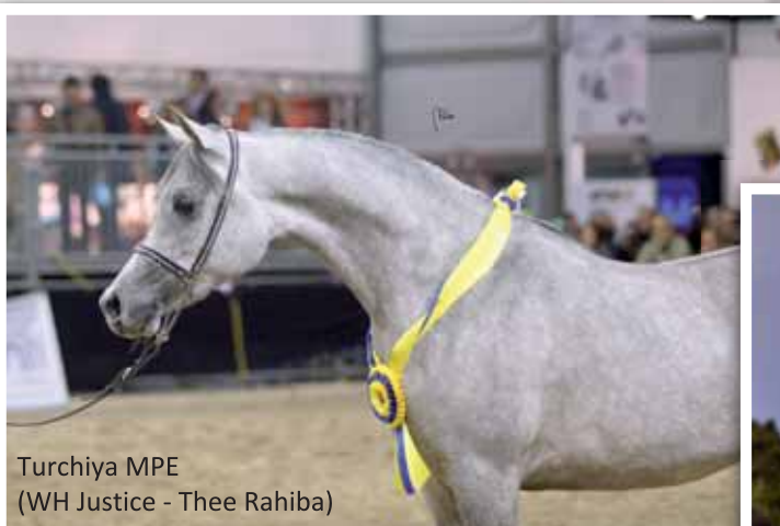
Turchiya MPE (WH Justice - Thee Rahiba)