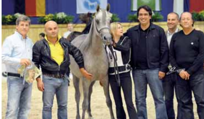
Turchiya MPE (WH Justice - Thee Rahiba)