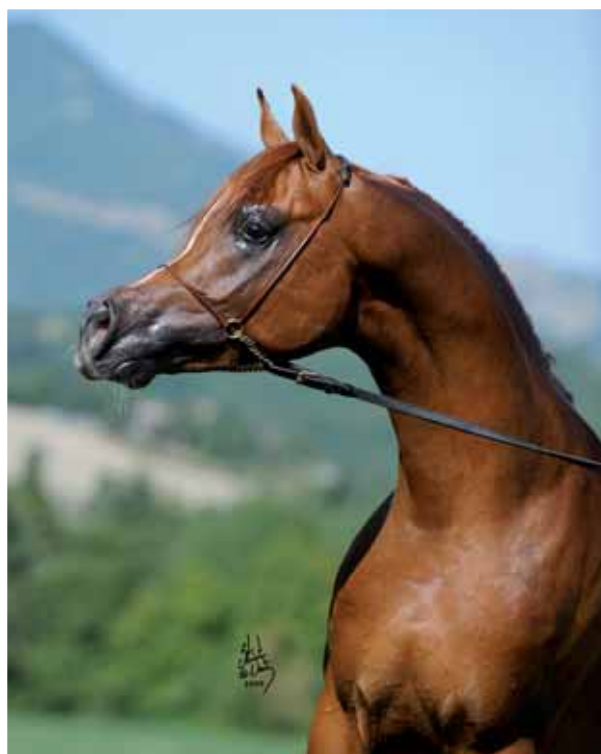
HDB SIHR IBN MASSAI ( MASSAI IBN MARENGA - MAYANA ) ON LEASE TO HARAS CRUZEIRO